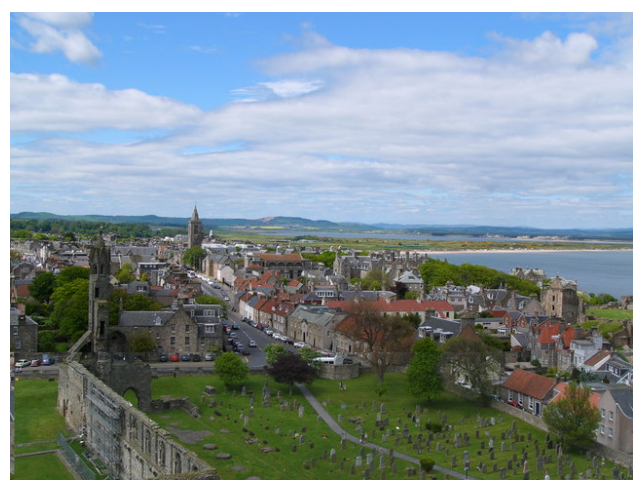
St Andrews, host of the 4th Channel Network Conference.

As you receive this newsletter, many of you will be preparing to leave for the 4th Channel Network Conference, alongside colleagues from Belgium, France, and Netherlands. We are delighted that this conference is being hosted by the British and Irish (BIR) region of the International Biometrics Society. The biennial meeting is a joint venture between the IBS regions of Belgium,